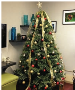
The decorated Christmas tree in the E5 "living room"