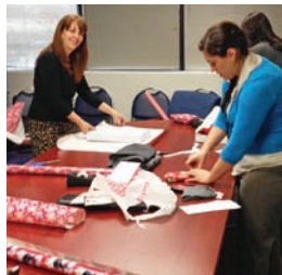
Strategic Solutions staffers busy wrapping presents