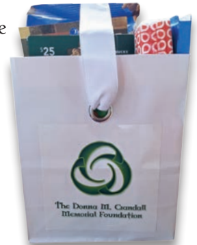
Right: The new DMCF Mini bag

Because CF patients can be admitted multiple times a year, the Foundation created the DMCF Mini to let patients know we are thinking of them each time they come to the hospital. The Mini contains gift cards to nearby restaurants and coffee shops, as well as Mary's UNO cards, snacks, tissues, and hand sanitizer.